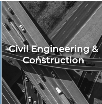
Civil Engineering & Construction